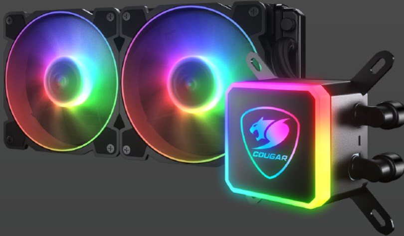
AQUA ARGB 240 AQUA ARGB 280