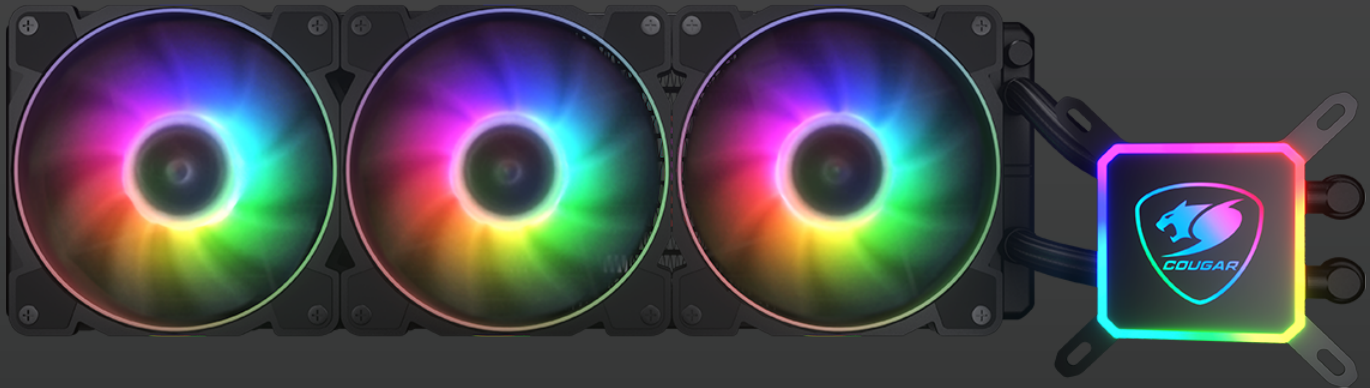
AQUA ARGB 360