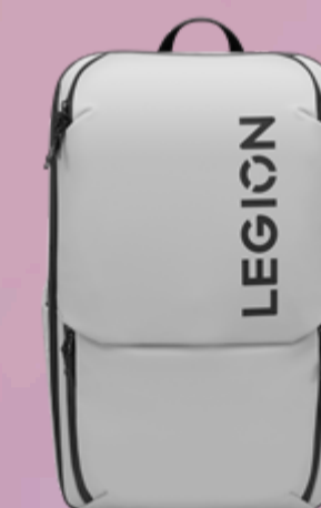
Lenovo Legion 17" Gaming Backpack GB800 (Light Gray) GX41U39300

Please click here to view the full list of accessories.