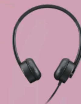
Lenovo Essential Stereo Analog Headset 4XD0K25030