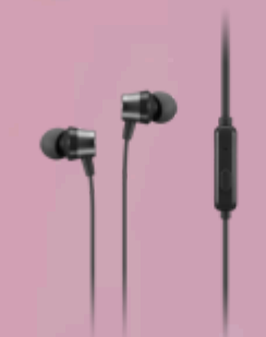
Lenovo Analog In-Ear Headphones Gen II Bulk Package (20pcs) 4XDIT54899